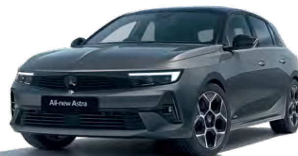
Vulcan Grey Two-coat metallic paint