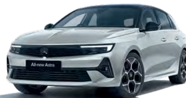
Crystal Silver Two-coat metallic paint