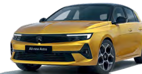
Electric Yellow Two-coat premium metallic paint