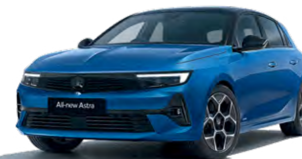
Cobalt Blue Tri-coat premium metallic paint