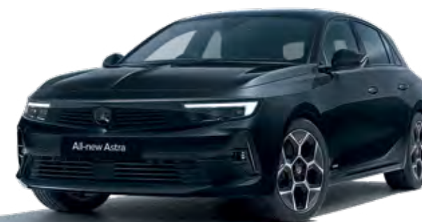
Carbon Black Two-coat metallic paint