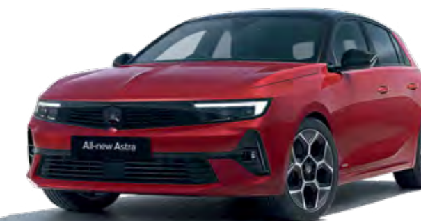
Crimson Red Two-coat premium metallic paint