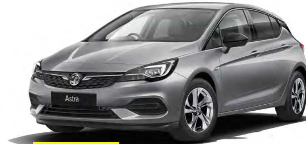
Cosmic Grey (GF5)** Two-coat metallic paint £550