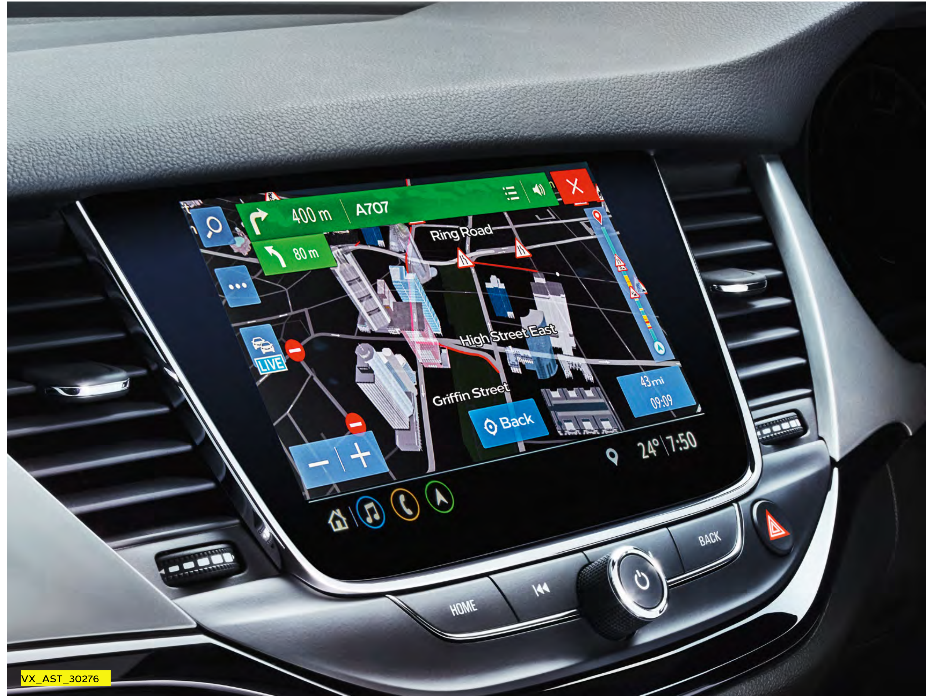
7-inch colour touchscreen.