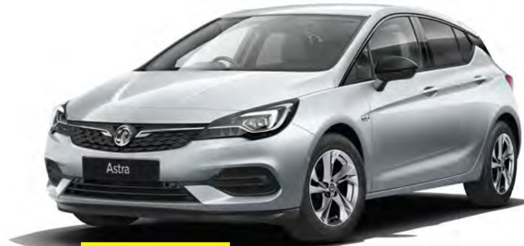
Sovereign Silver (GAN)* Two-coat metallic paint