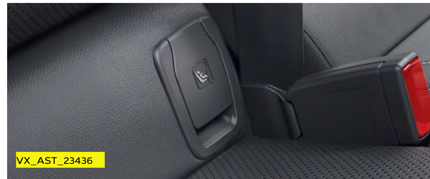
ISOFIX child seat mountings.