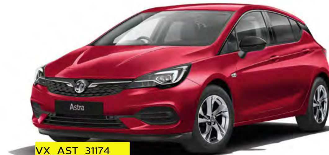
Hot Red (G1R)** Two-coat premium paint £650