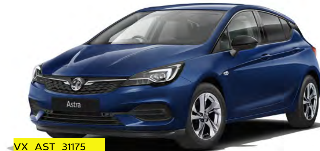
Navy Blue (G4B)** Two-coat metallic paint £550