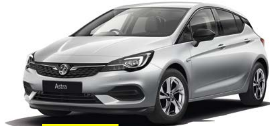
Sovereign Silver (GAN)* Two-coat metallic paint