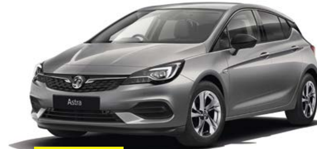
Cosmic Grey (GF5)** Two-coat metallic paint £550