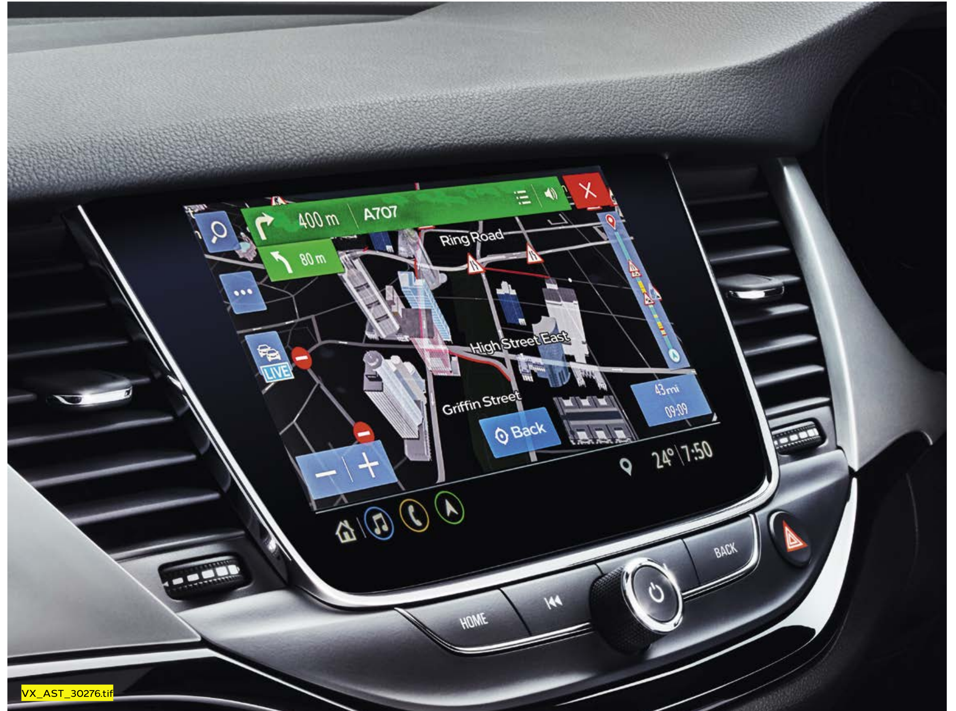
7-inch colour touchscreen.