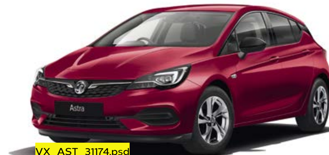
Hot Red (G1R)** Two-coat premium paint £650