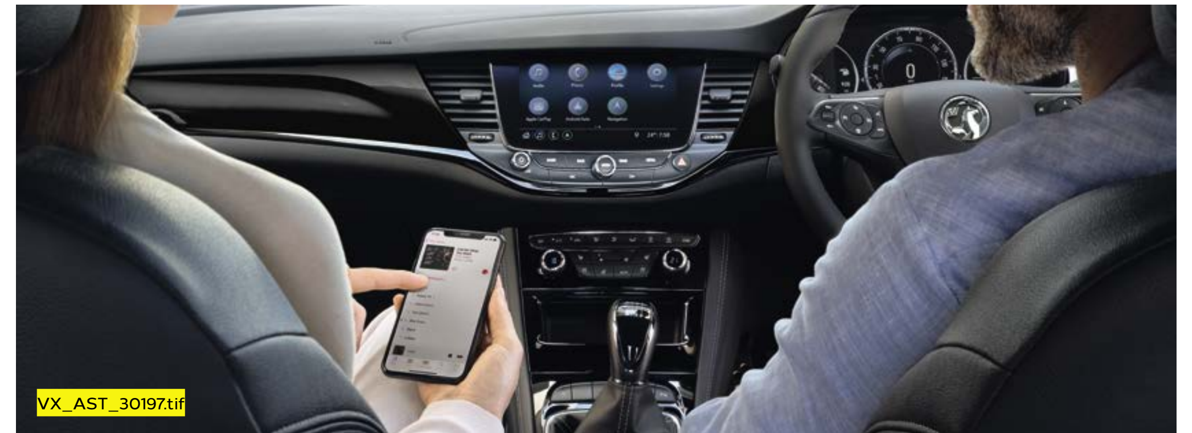
VX_AST_30197.tif Smartphone projection.