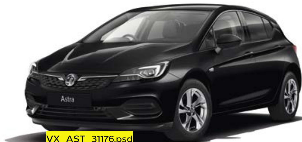
Mineral Black (GB9)** Two-coat metallic paint £550