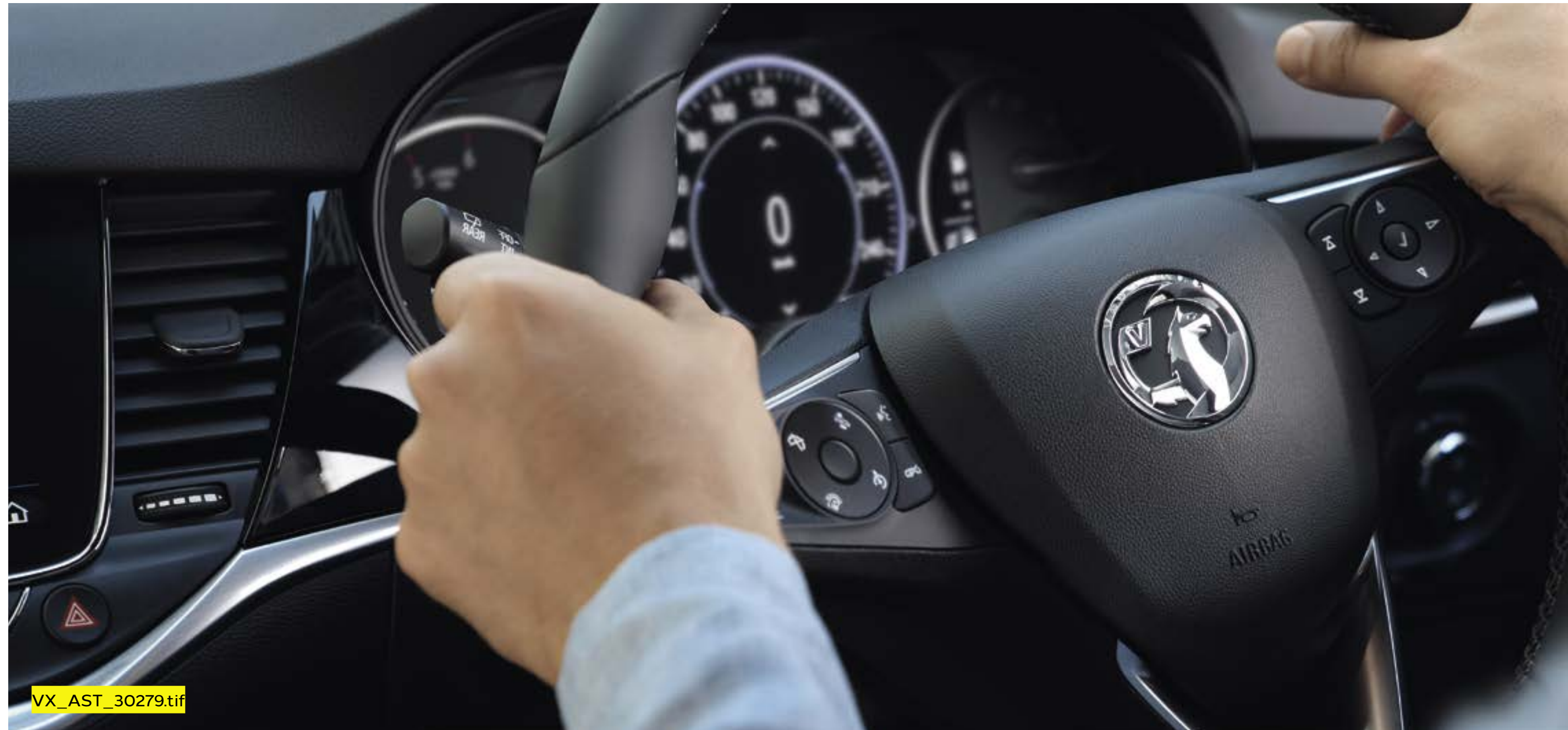
8-inch colour digital information display.