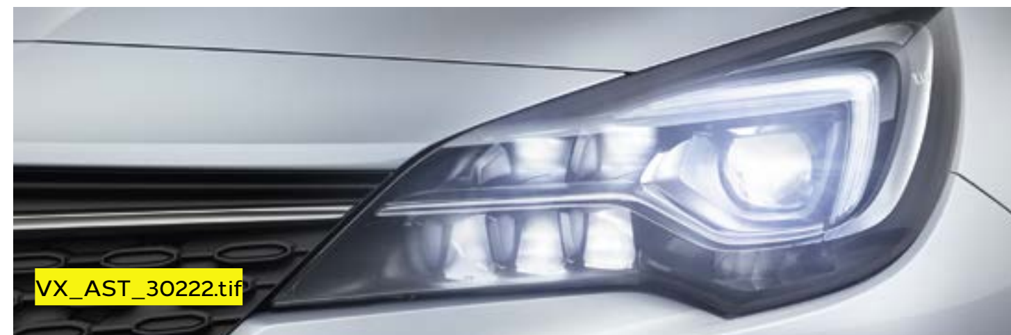
IntelliLux LED® Matrix headlight.