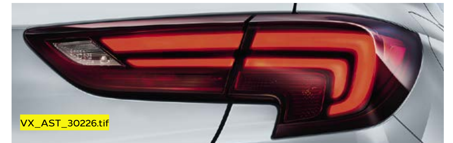
LED tail lights.