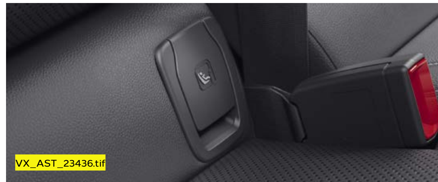
ISOFIX child seat mountings.