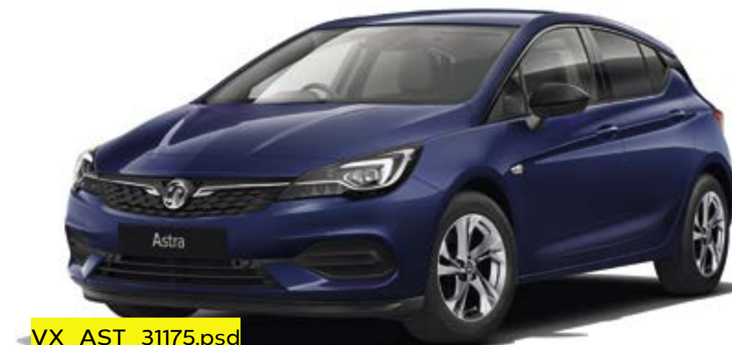
Navy Blue (G4B)** Two-coat metallic paint £550