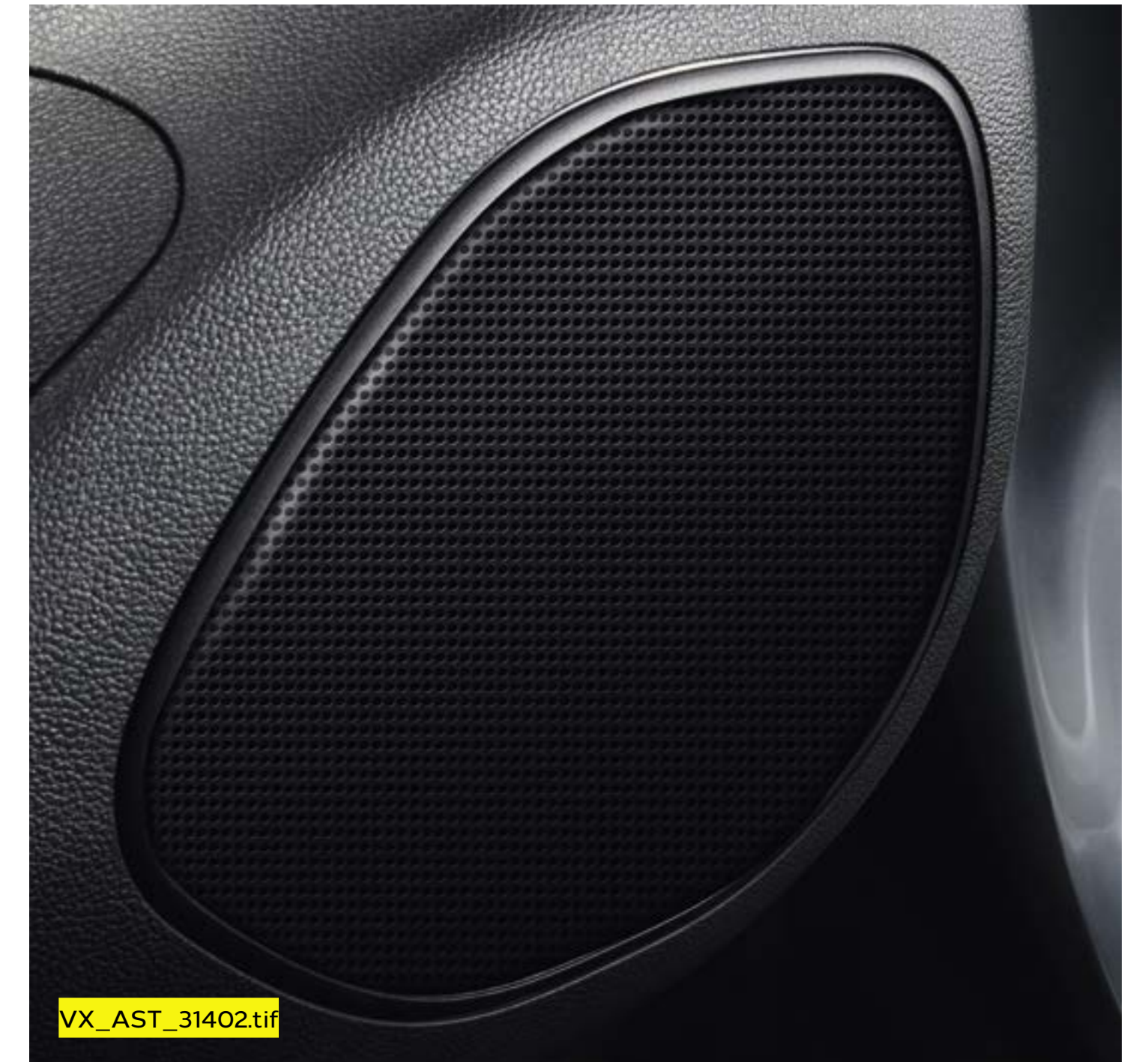
Bose sound system.