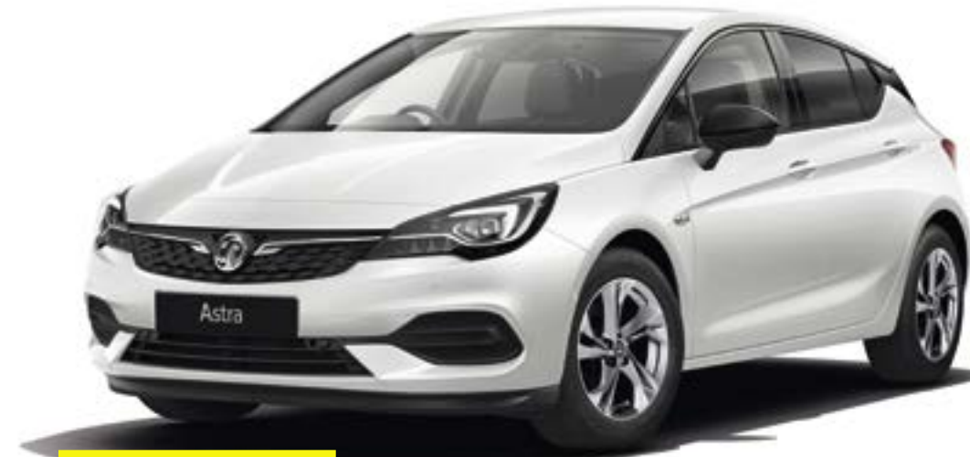
Summit White (GAZ)** Brilliant paint £320