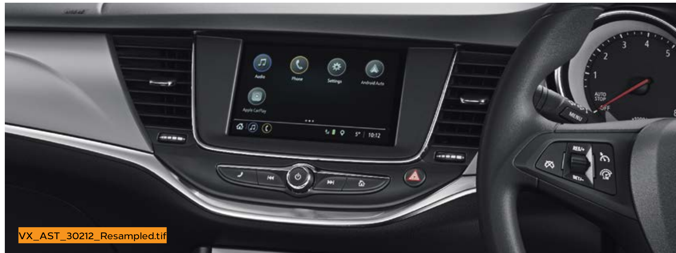
VX_AST_30212_Resampled.tif 7-inch colour touchscreen.