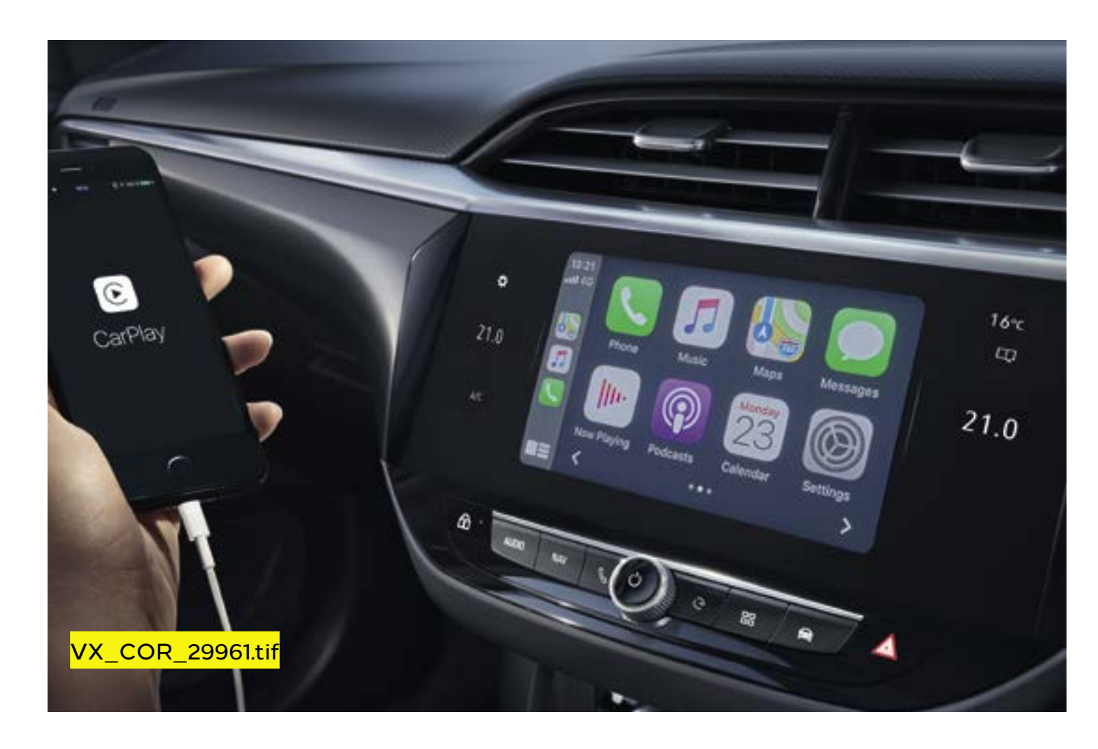
Please note, Apple CarPlay screen illustrated on 10-inch colour touchscreen.