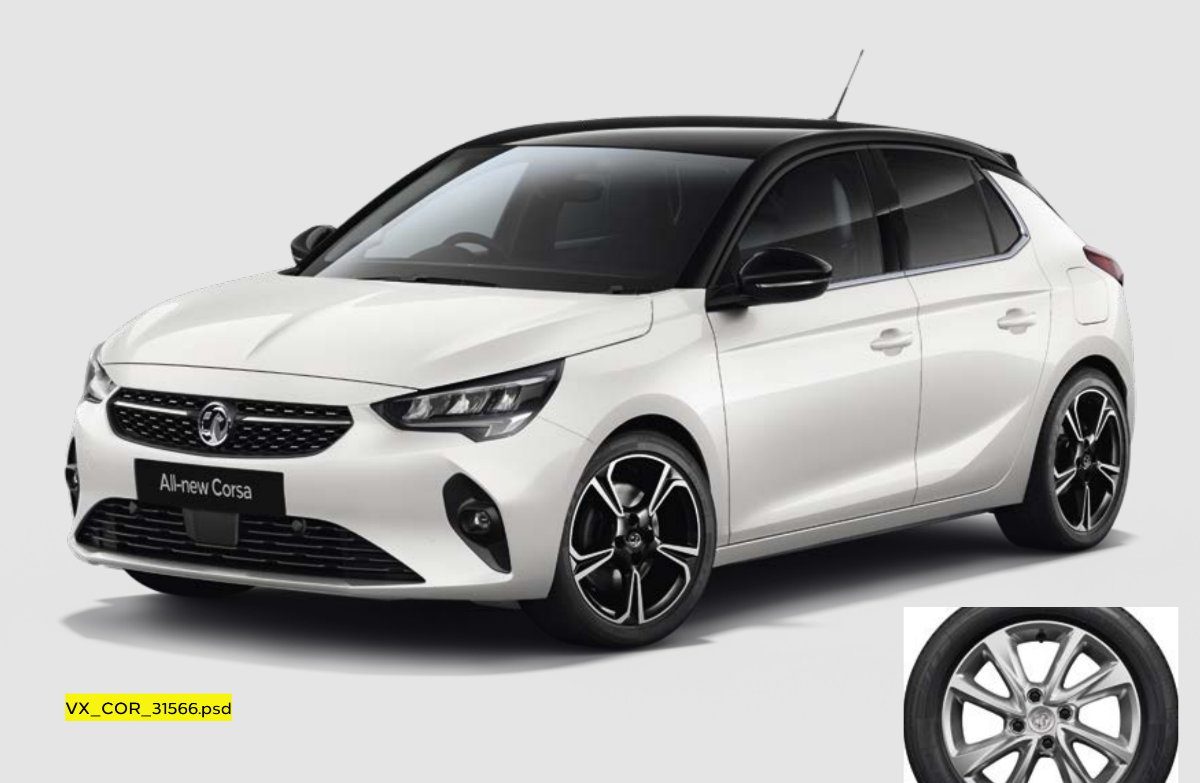
Elite alloy wheel.