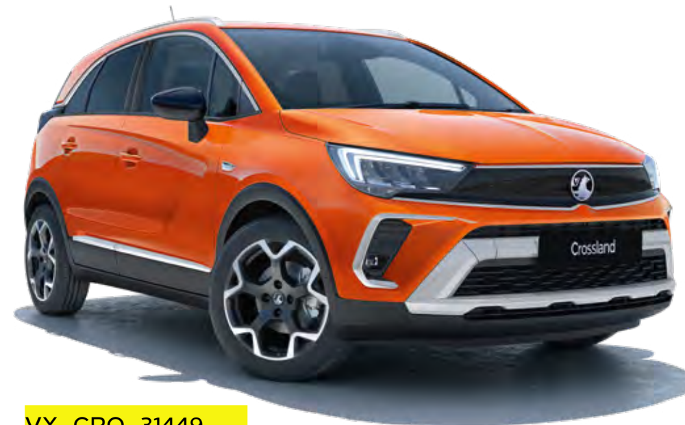
Power Orange (GPQ)** Two-coat premium paint £650†