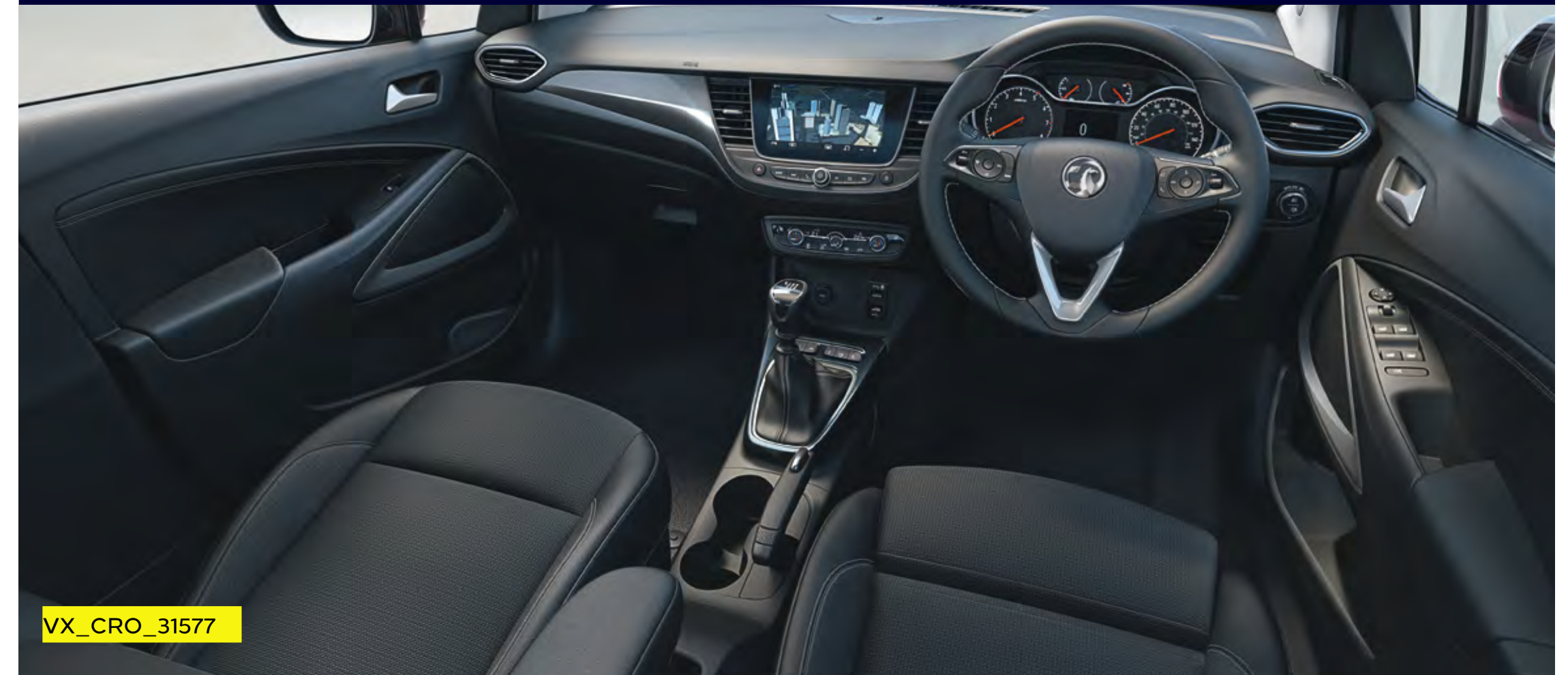
Elite/Elite Nav Models