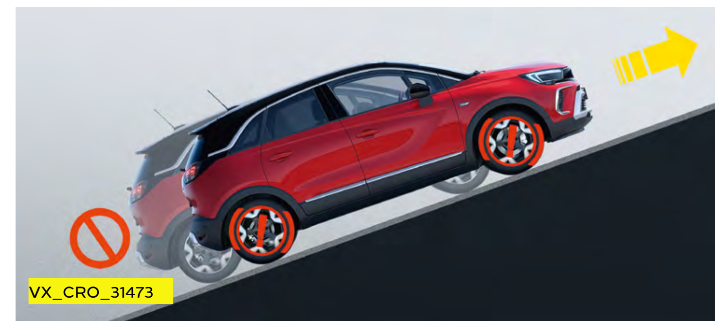
Hill start assist.