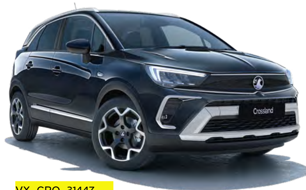
Diamond Black (G7O)** Two-coat metallic paint £550†