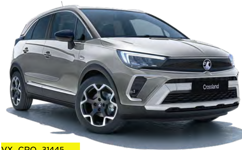
Quartz Grey (G4I)** Two-coat metallic paint £550†