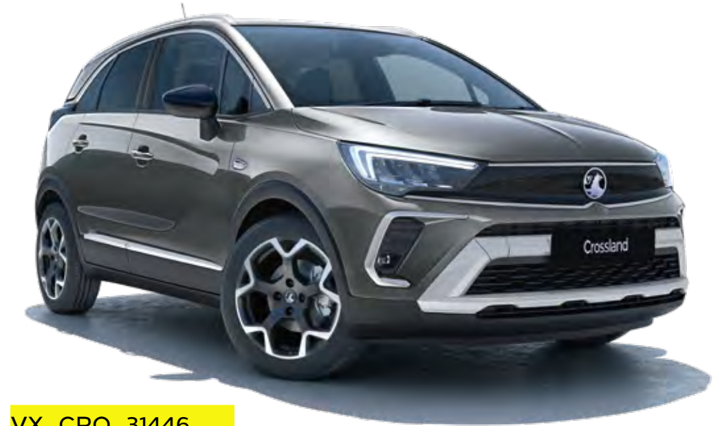
Moonstone Grey (G4O)** Two-coat metallic paint £550†