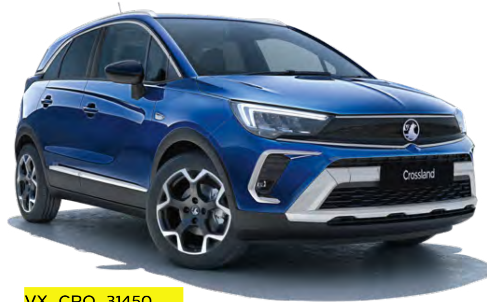
Navy Blue (G4B)* Two-coat metallic paint