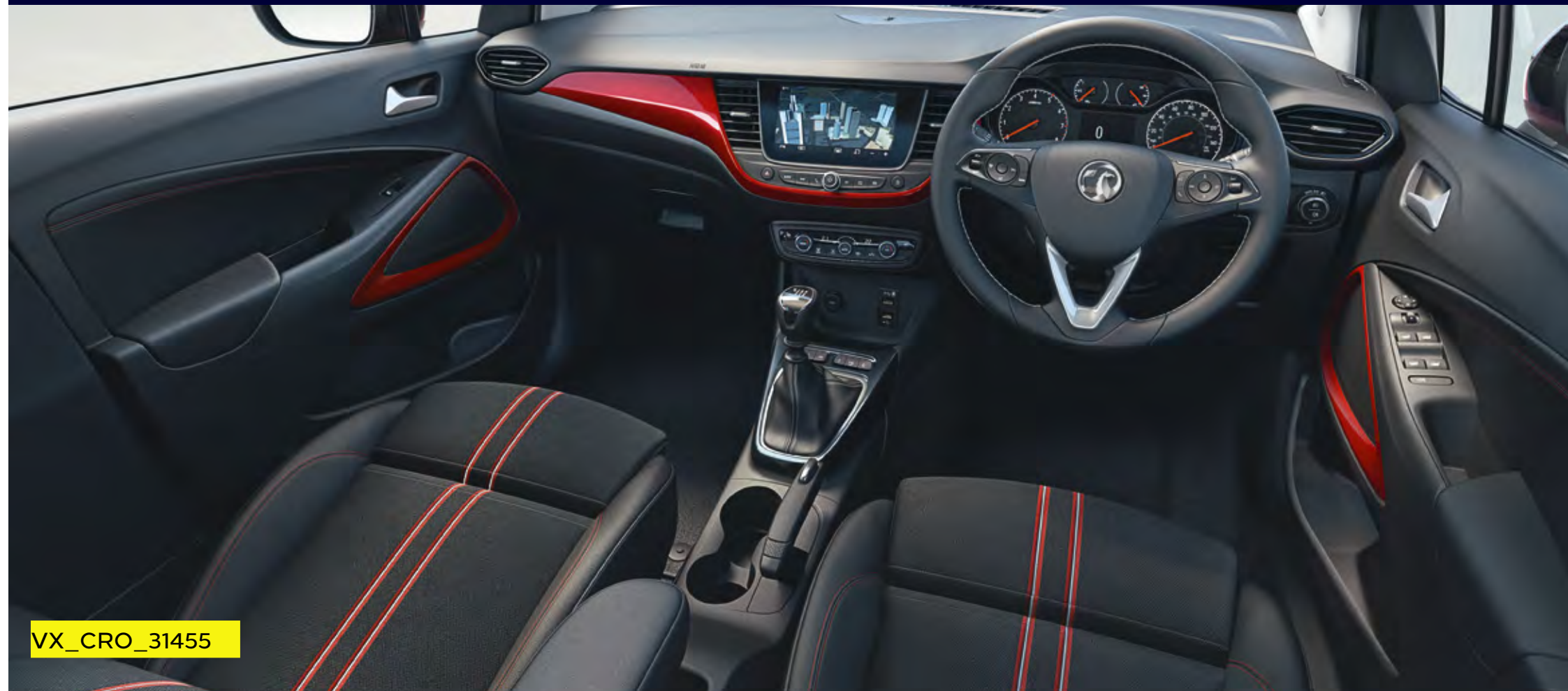
SRi Nav Models