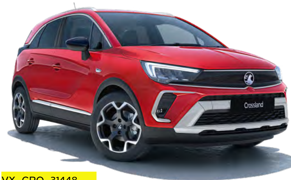
Hot Red (G1R)** Two-coat premium paint £650†