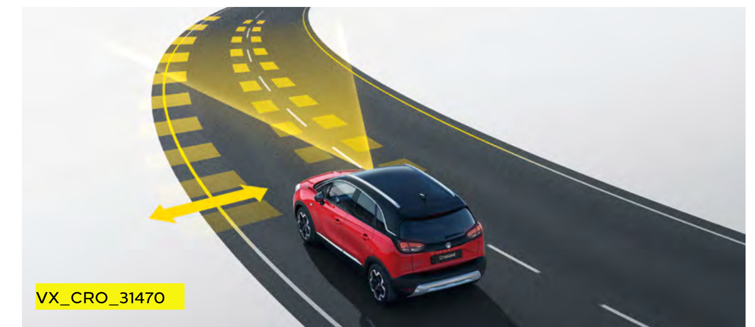
Lane departure warning (see next page for feature description).

Vauxhall driver assistance systems are intended to support the driver within the system-imminent limitations. The driver remains responsible for the driving task at all times.