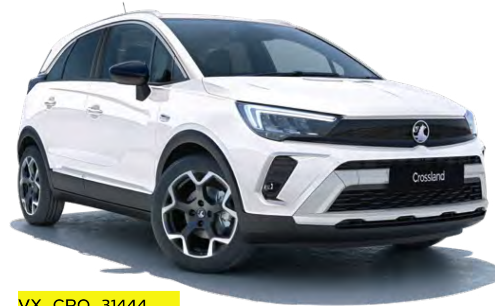
White Jade (G20)** Brilliant paint £320†