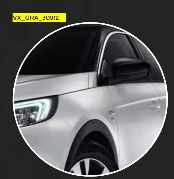
White Jade Brilliant