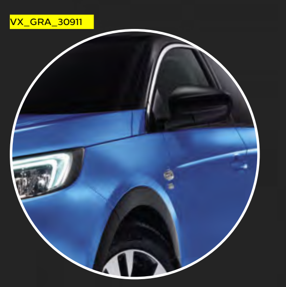
Topaz Blue* Premium Metallic