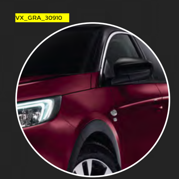
Dark Ruby Red* Premium Metallic