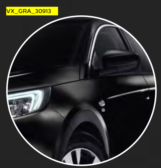
Diamond Black* Metallic