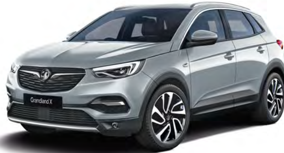
Quartz Grey (G4i)** Two-coat metallic paint £600