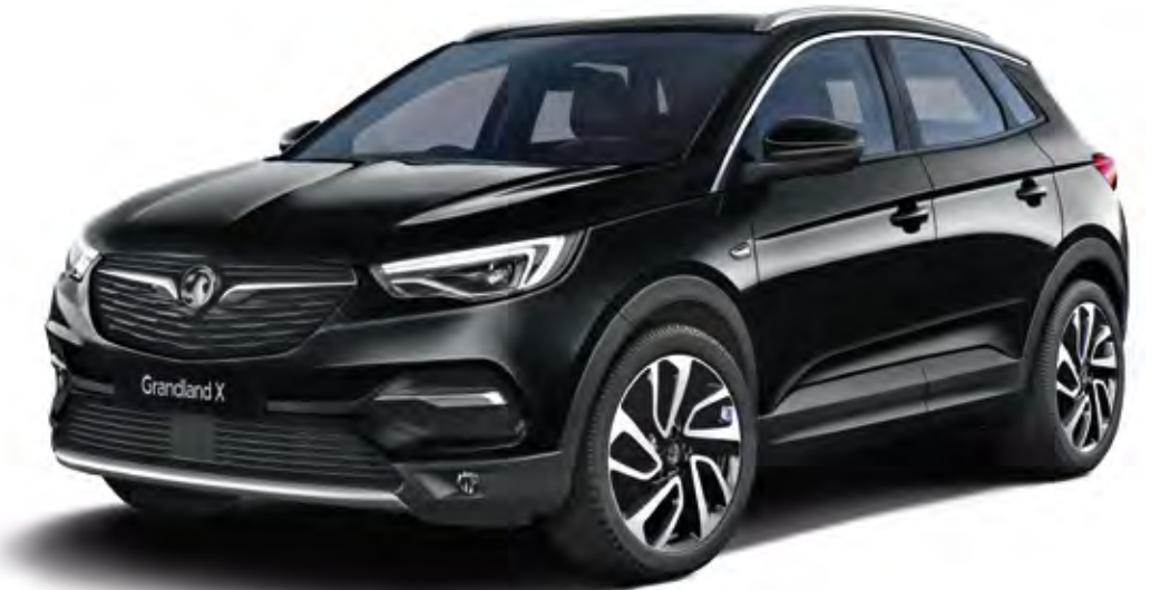
Diamond Black (G1o)** Two-coat metallic paint £600