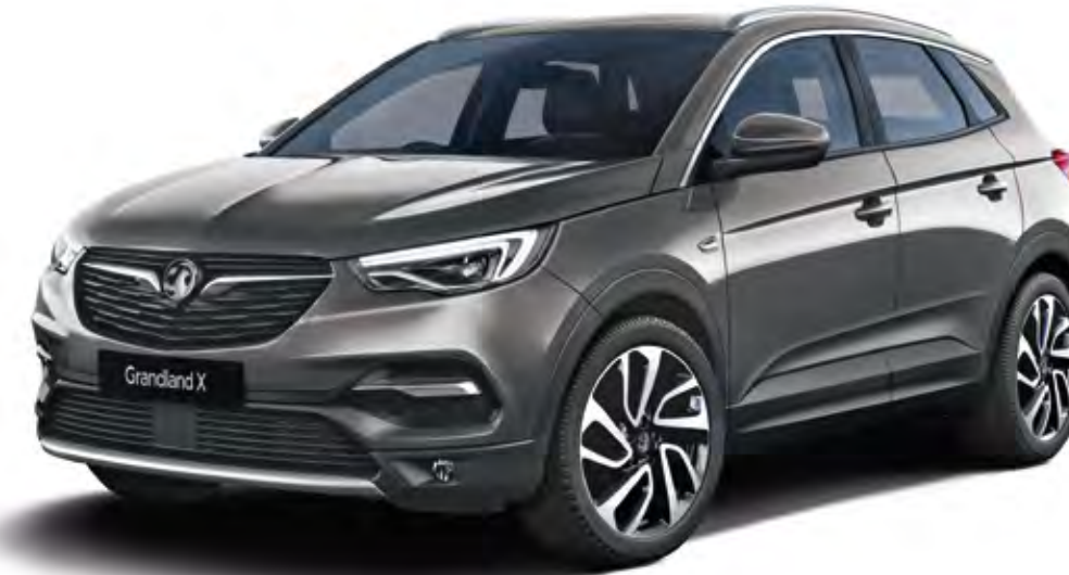
Moonstone Grey (G4o)** Two-coat metallic paint £600