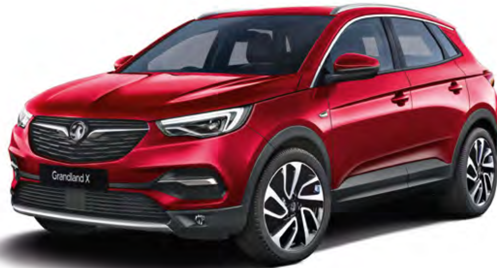
Dark Ruby Red (GDU)** Two-coat premium paint £710