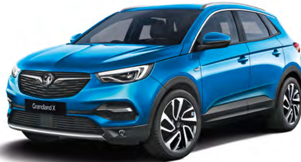
Topaz Blue (G8Z)** Two-coat premium paint £710