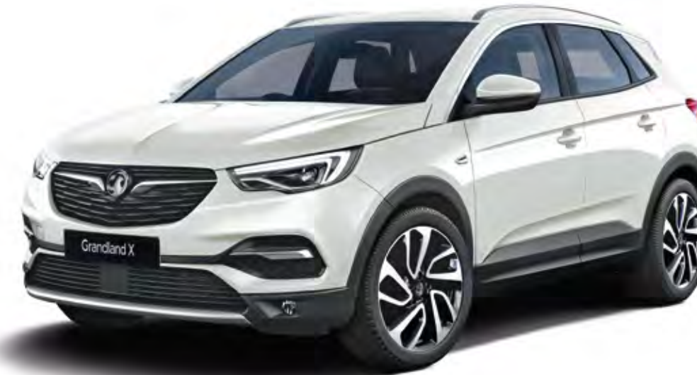
Pearl White (G1o)** Tri-coat premium paint £870