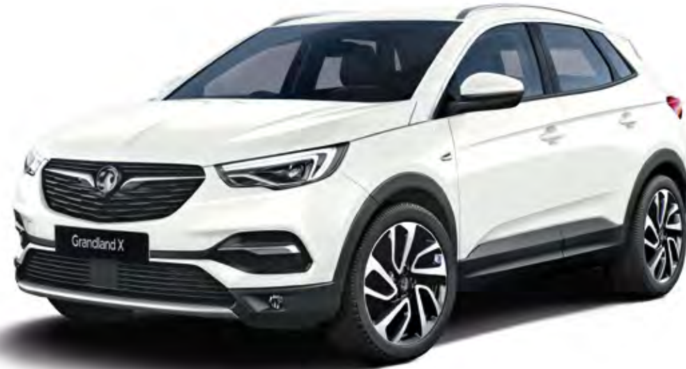
White Jade(G2o)* Brilliant paint