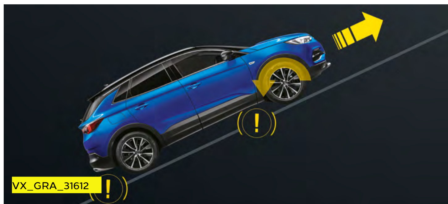
Hill start assist.