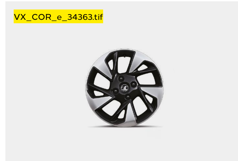
16-inch alloy wheel.