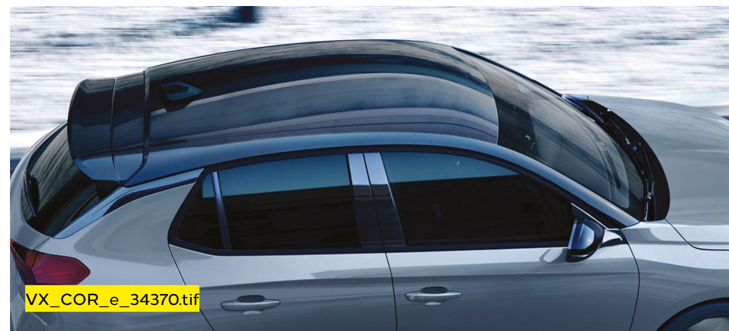
Black roof and dark-tinted rear windows.