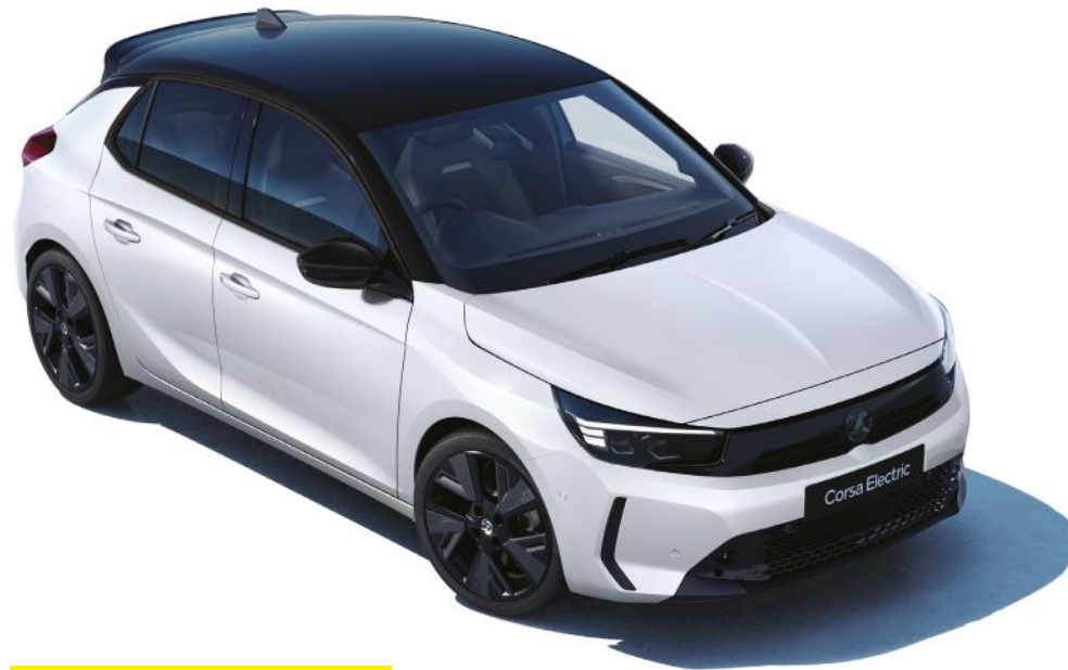
Arctic White (POWP)* Brilliant paint