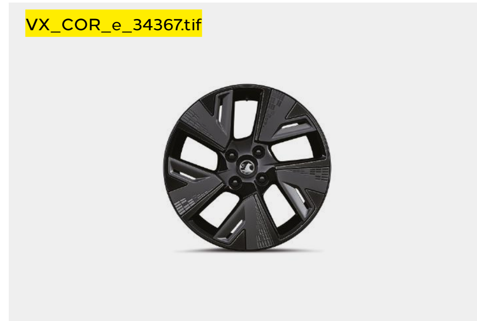
17-inch alloy wheel (Electric only).