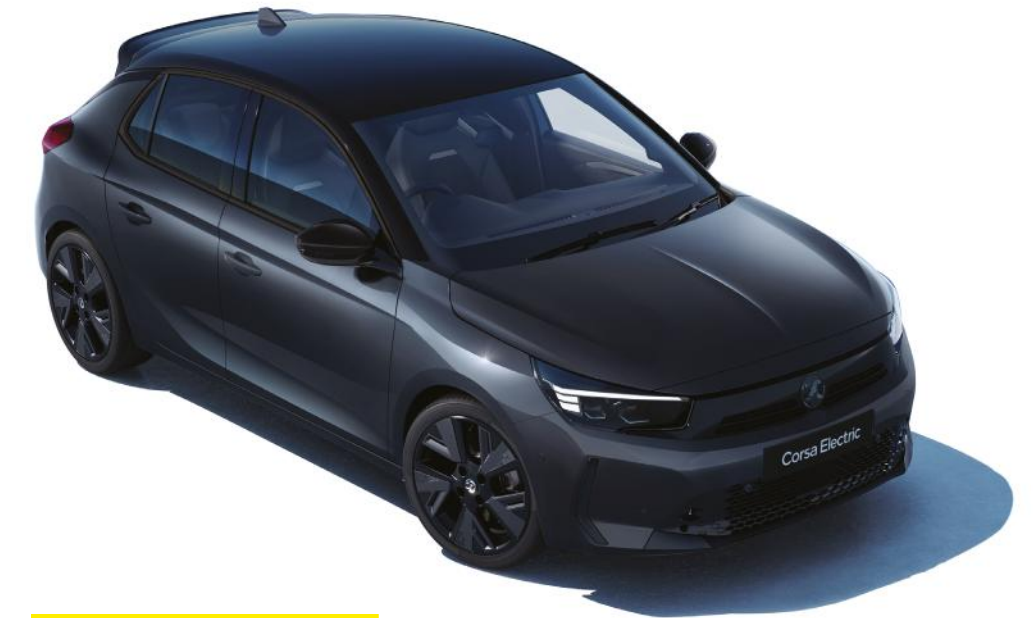
Carbon Black (M09V)** Two-coat metallic paint £600