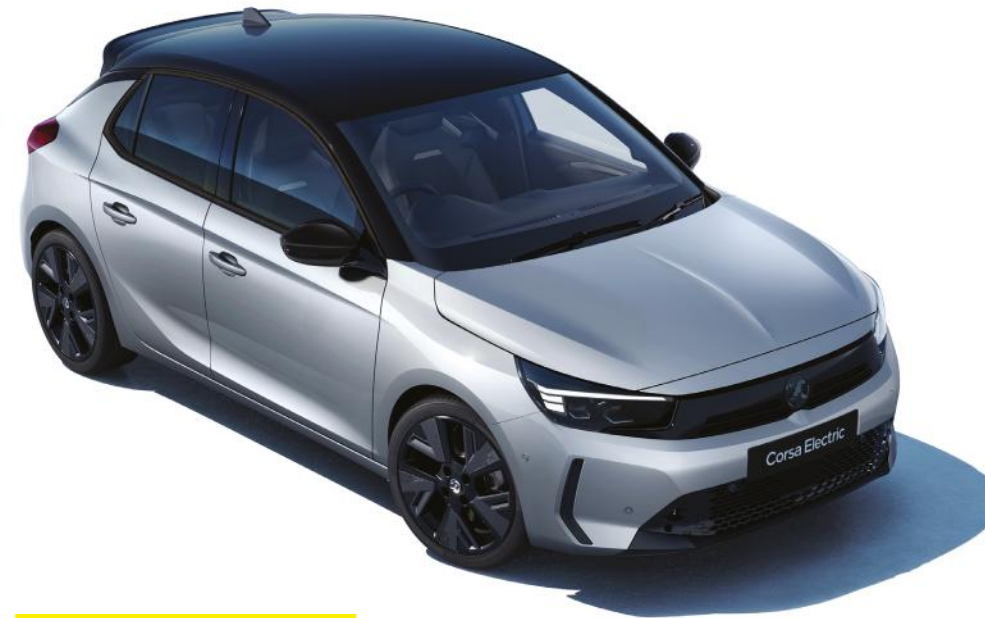
Crystal Silver (MOZR)** Two-coat metallic paint £600