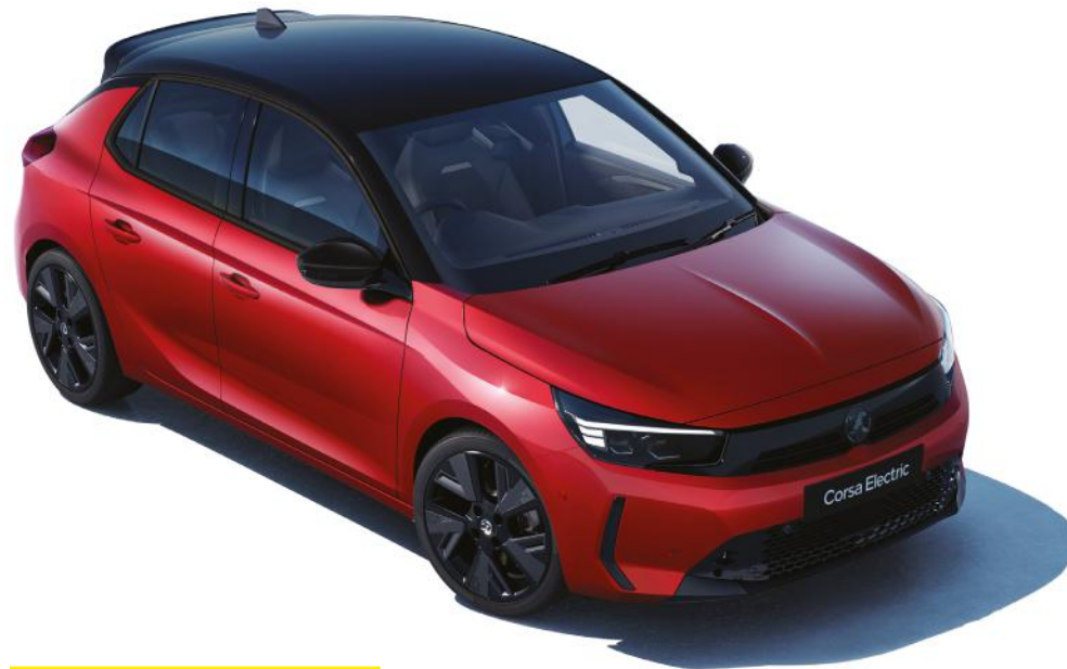
Crimson Red (MOPQ)** Two-coat premium metallic paint £700