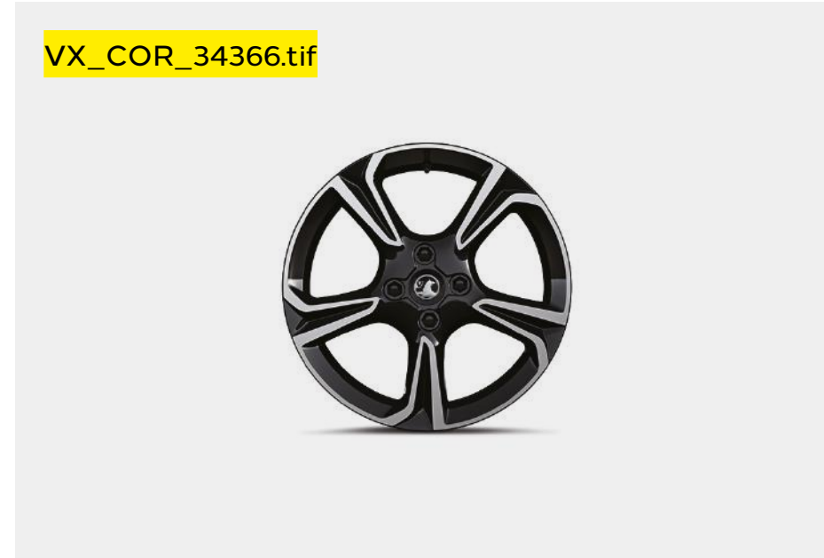
17-inch alloy wheel.