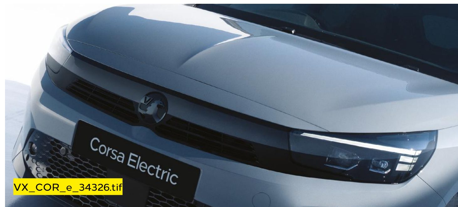
Black Griffin logo and vizer frame.