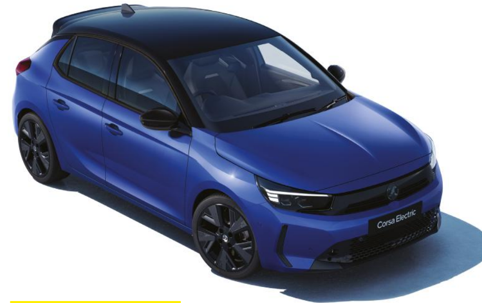
Voltaic Blue (MOAV)** Two-coat metallic paint £600