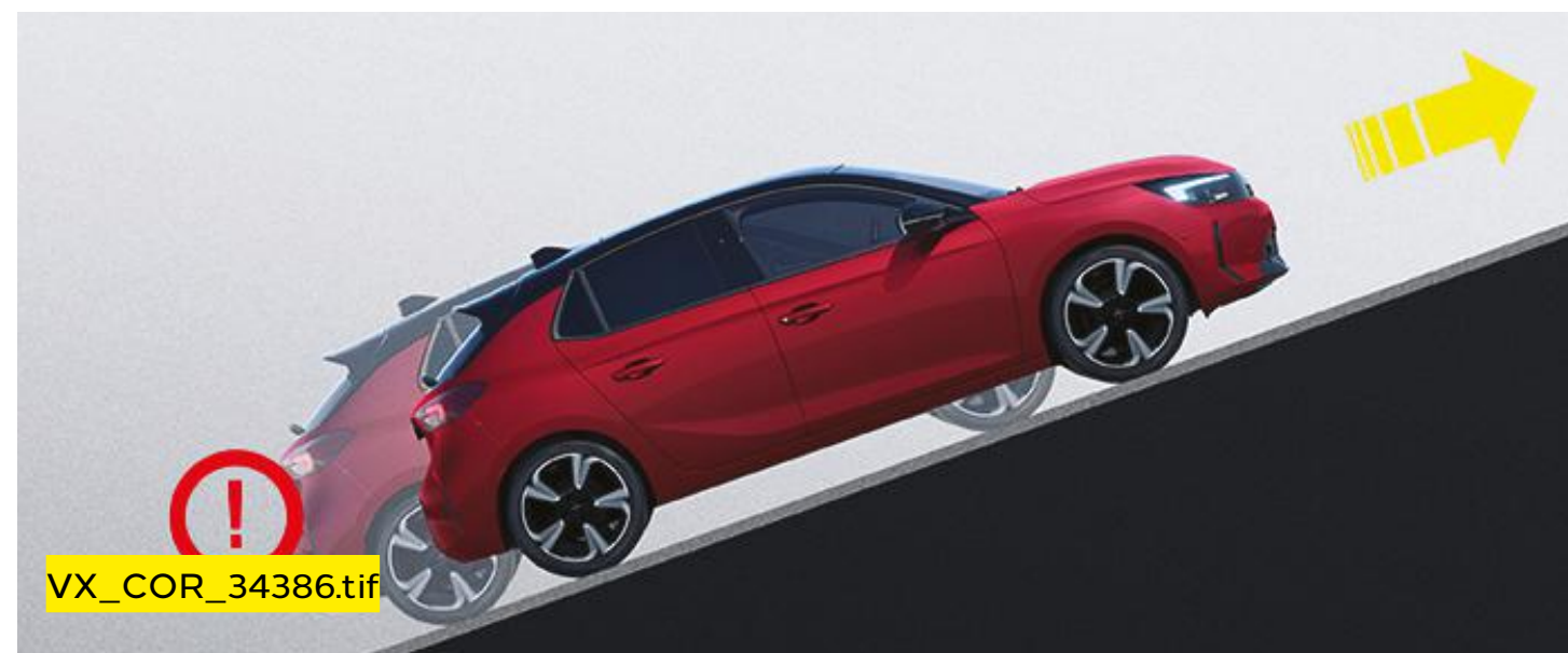
Hill start assist.