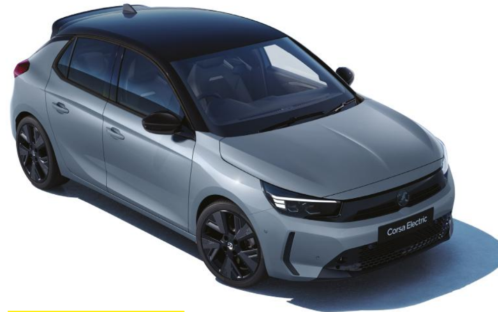
Graphic Grey (POSD)** Two-coat premium metallic paint £700