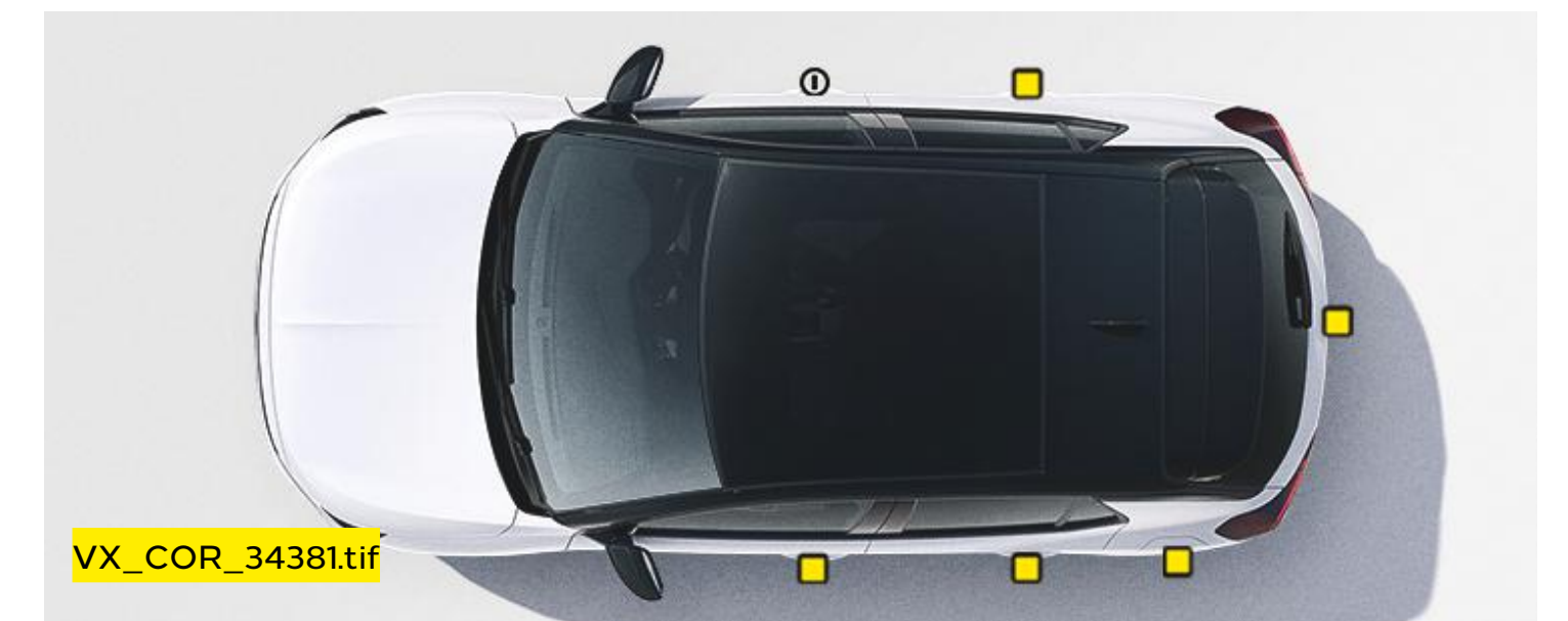
Remote control central locking.