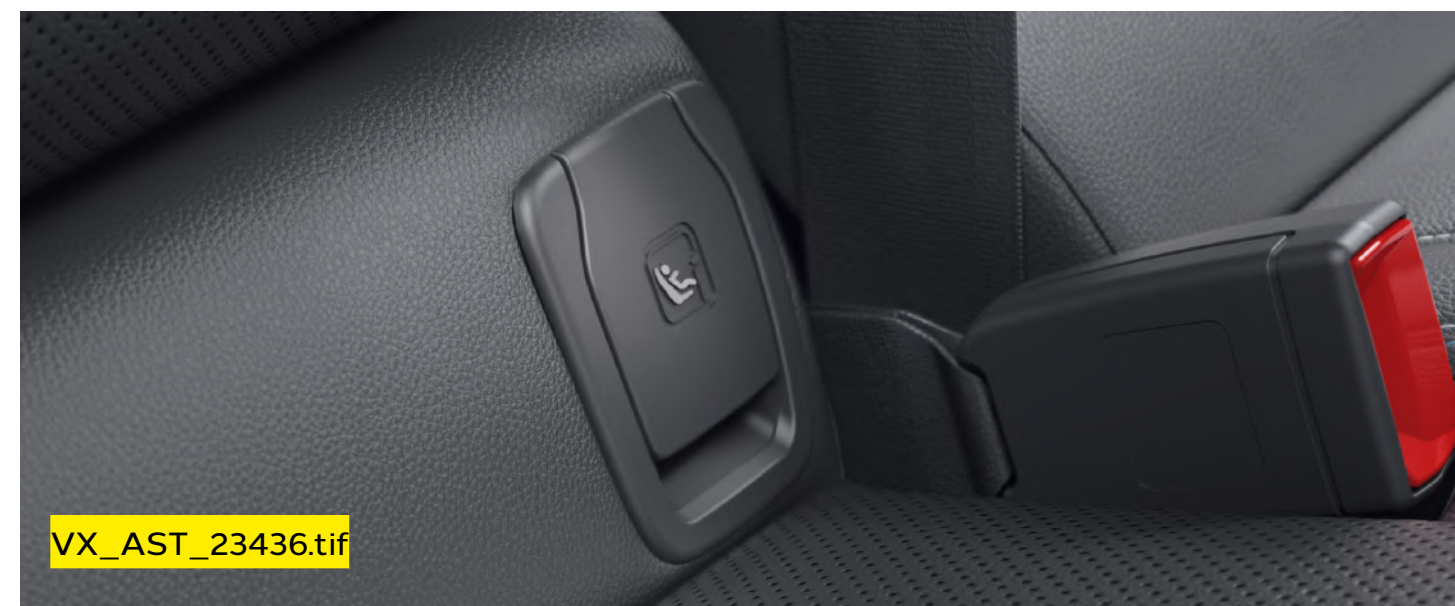
ISOFIX child seat mountings.