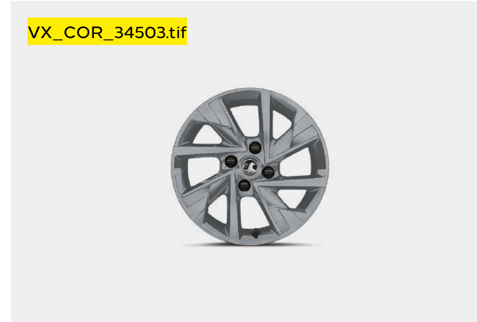
16-inch alloy wheel.