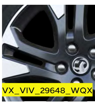
17-inch diamond-cut alloy wheels

16-inch steel wheels with centre cap • 215/65 R 16 tyres