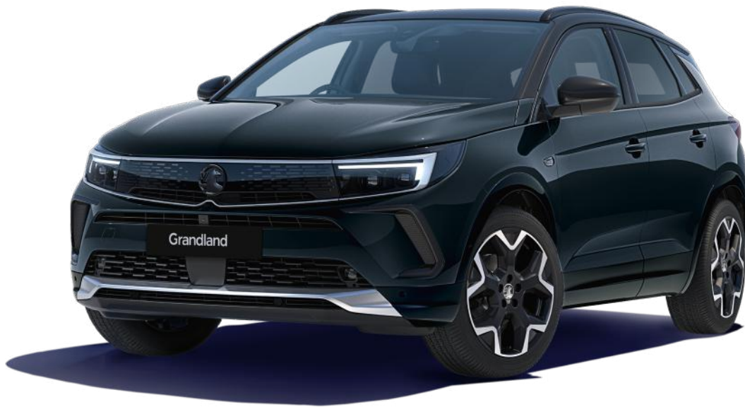
Carbon Black (OMMO/ON9V)** Two-coat metallic paint £600