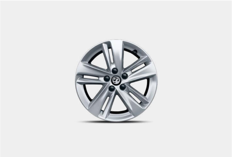
17-inch alloy wheel.