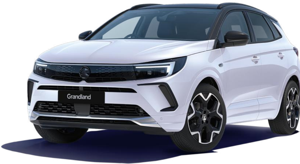
Arctic White (OMPO/ONWP)* Brilliant paint