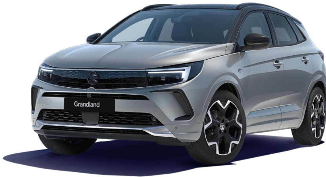
Contrast Grey (OMMO/ONF4)** Two-coat metallic paint £600