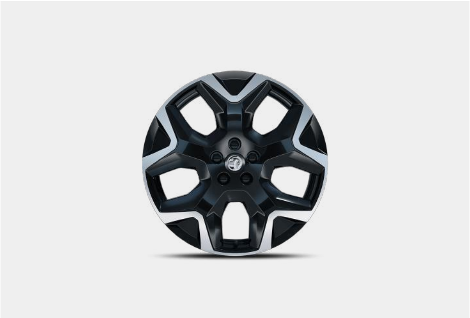
19-inch alloy wheel.