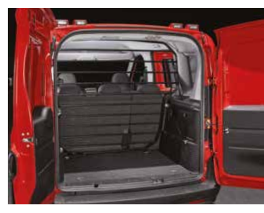
Load area with steel load guard.