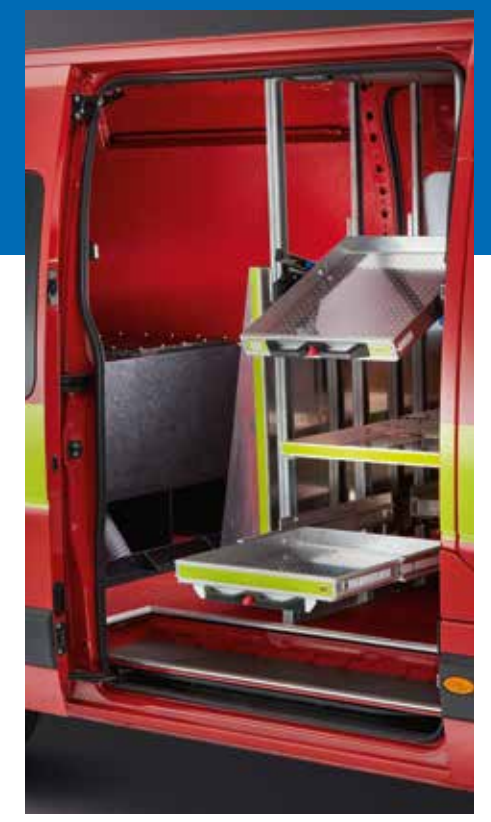
Configurable racking system.