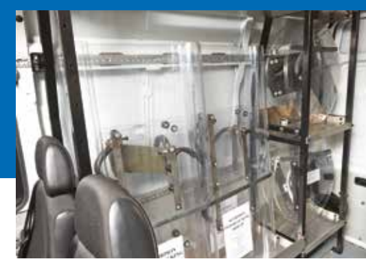
Configurable storage solution.