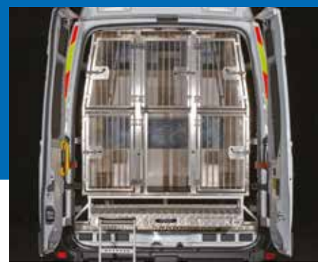
Six compartment dog cell.