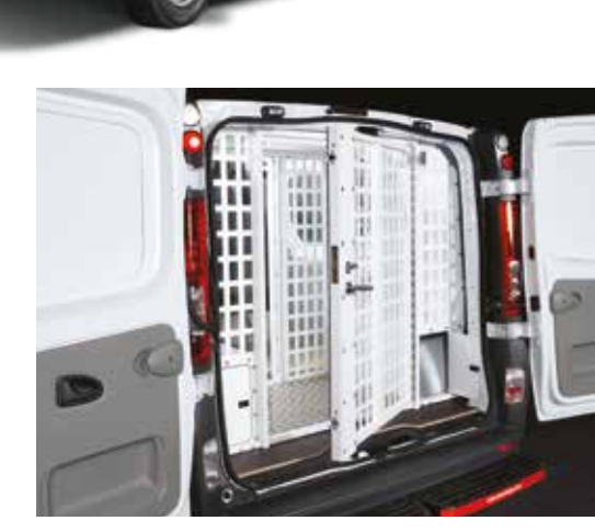
Image shown features storage box and configurable seating solution.