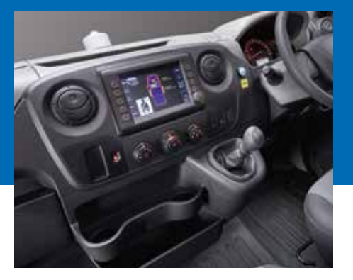
Fully integrated control panel.