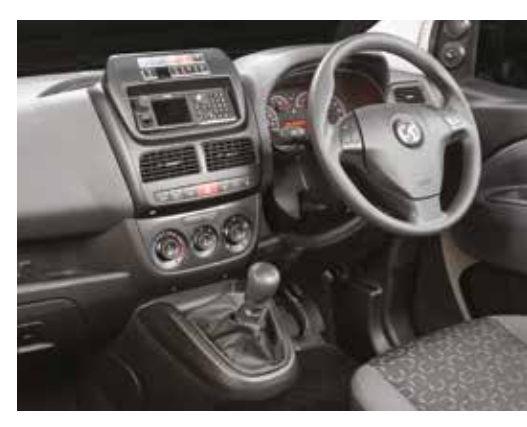
Image shown includes combined 10-way switch panel and aperture for communications head unit.