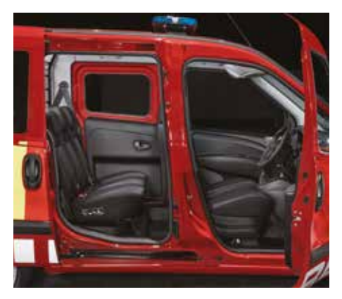
Twin glazed sliding side doors.