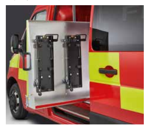
Pull-out vertical bulkhead.