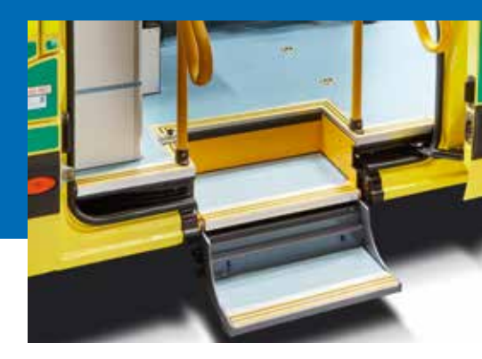
Side access fold out step.