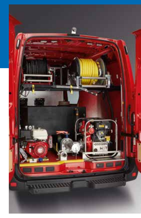
Large load area allows ample room for easy operation of equipment.