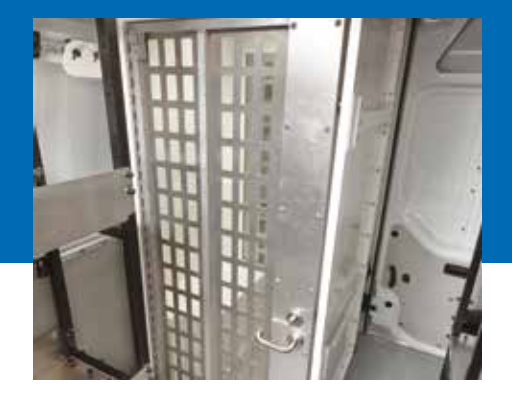
Single containment cell.