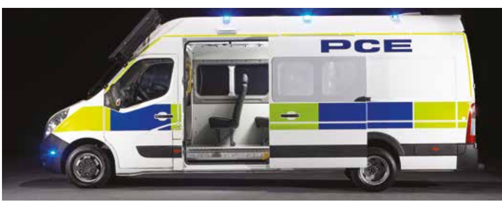
Image shown features 360° high level lighting and nearside despatch light.