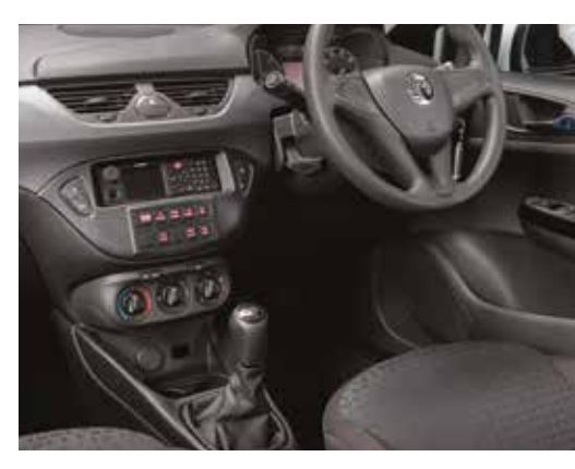
Image shown includes combined 10-way switch panel and aperture for communications head unit.

* = Emergency model based on Design trim.