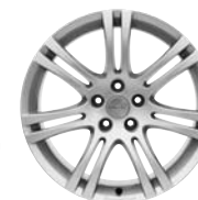
Stila 6.5J x 15 £733 6.5J x 16 £811 8J x 18 £1590