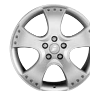
Sport Star 7J x 17 £1304 18 8J x 18 £1808