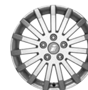
Signa 6.5J x 16 £811 8J x 18 £1590