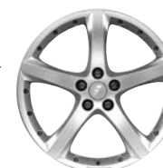
GT Star 6.5J x 16 £811 8J x 19 £1923