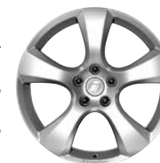
Evo Star 7.5J x 18 £1590 Insignia 8.5J x 20 £2040 Antara 8.5J x 20 £2066

Please note: Fully fitted price, excluding tyres, includes static wheel balancing. Fitting larger diameter wheels than standard will require the fitment of new tyres at extra cost. Many other styles and finishes are available, see www.vauxhall-accessories.com for details.