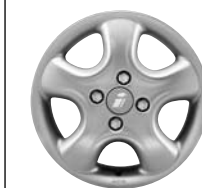
Softstar 6J x 14 £663

* = Prices shown are a special fully fitted (and painted, where applicable) price at participating retailers only. Please check with your local Vauxhall retailer for details. All other prices exclude fitting. It is advisable to ensure your insurance policy is adequate to cover additional fitted accessories. Prices correct at time of publication.